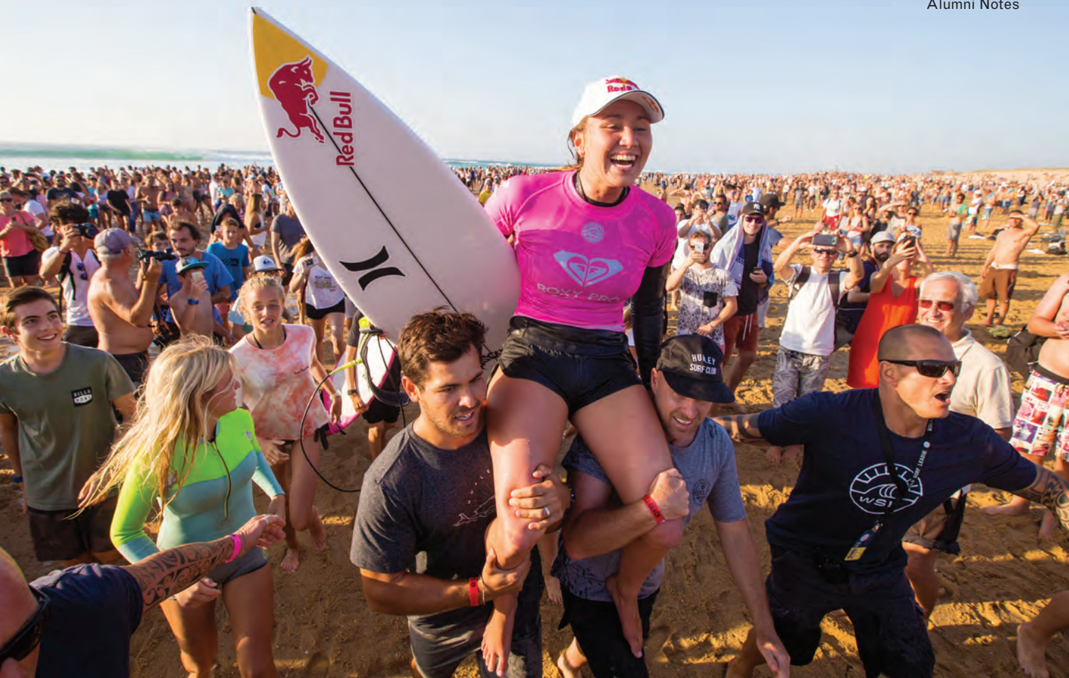
Congratulations to Carissa Moore '10, who won the 2019 Roxy Pro France for the third time in her career after winning the final at Le Graviere in Hossegor, France.