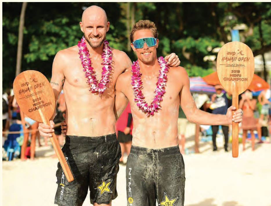
Congratulations to Jake Gibb and Taylor Crabb '10, who won the AVP Hawaii Open in Honolulu.