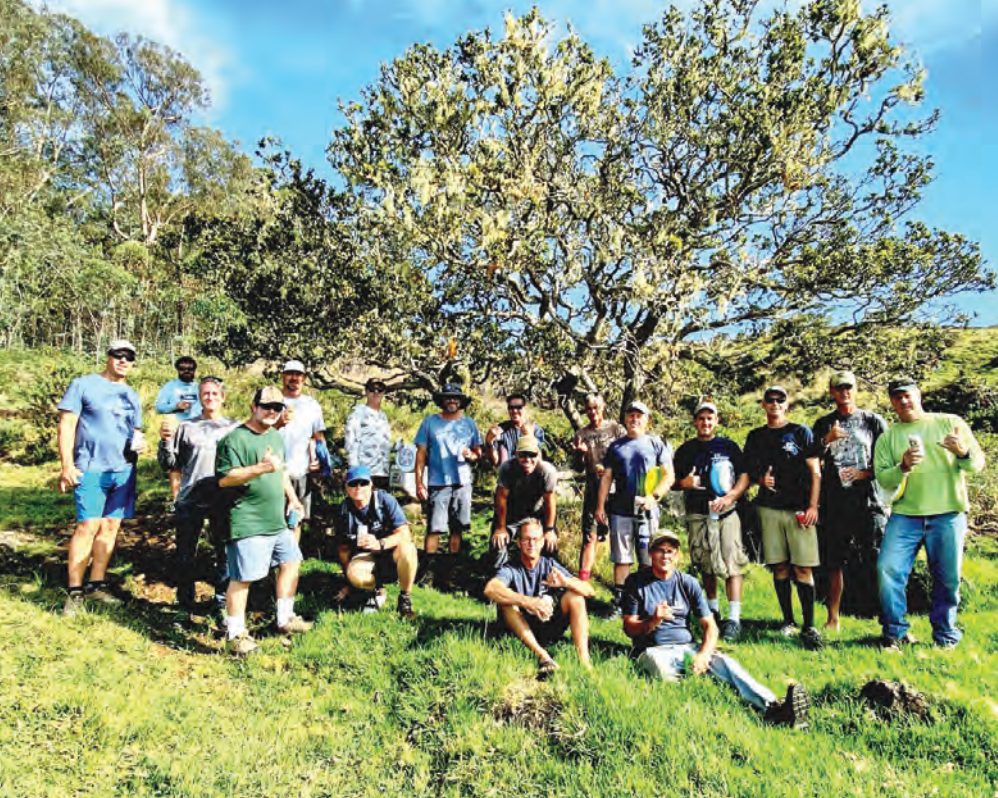
Punahou alumni from the Classes of '82, '83 and '85 at Polipoli Frisbee golf course on the slopes of Haleakala.