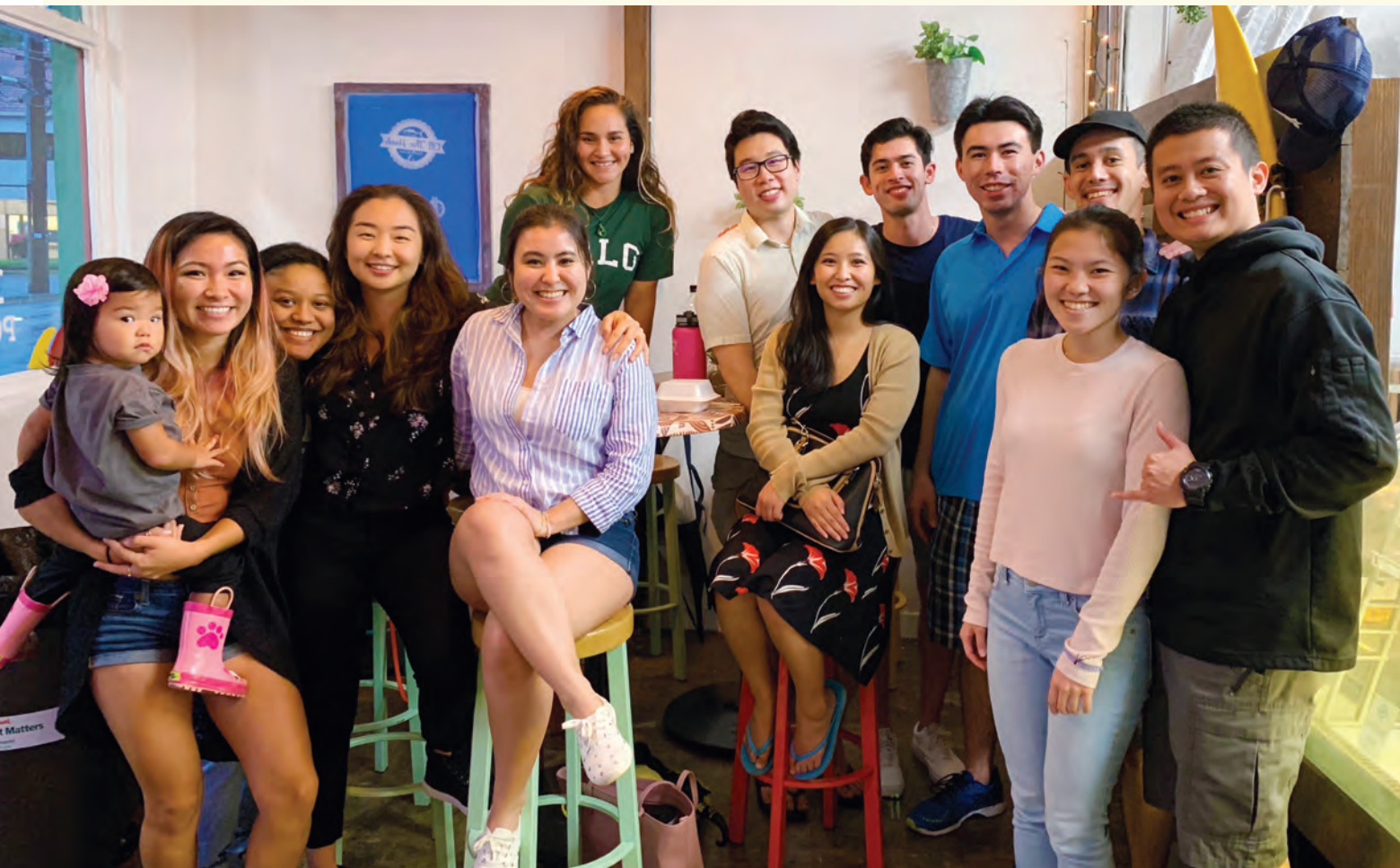
Classmates from 2012 gathered after the "Off the Hook Event" at Manoa Marketplace on Dec. 28, 2018.