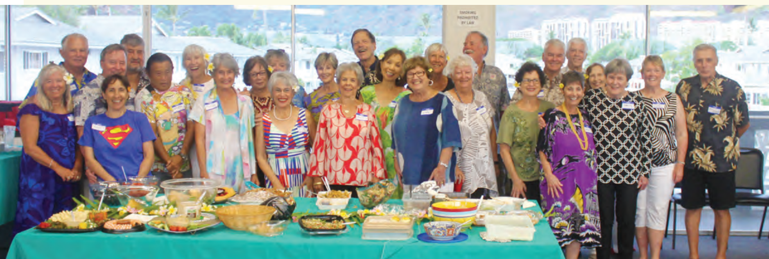
The Class of 1961 gathered at Kuapa Isle to celebrate their 75th birthdays.

I was looking back on the planning for the 75th birthday parties both here, and on the coast. The planning was filled with detail. Create an email invitation; reserve the facility for the event; do a menu and come up with a cost to