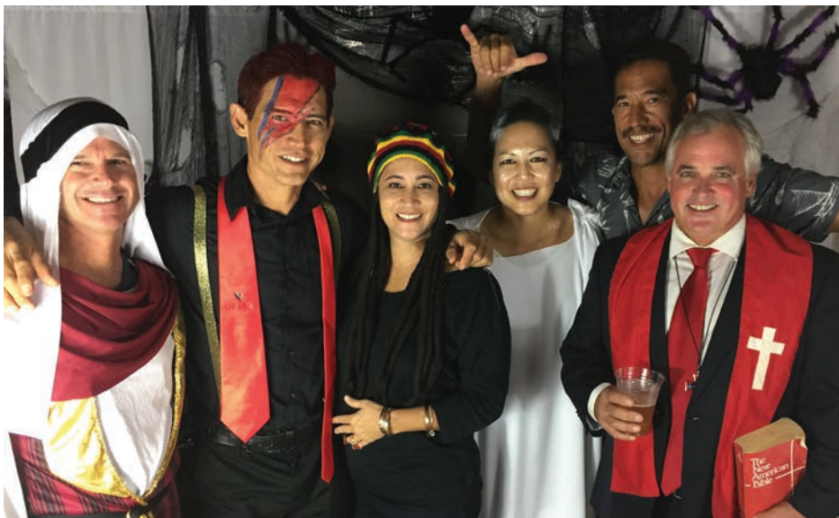
Members of the Class of '89 gathered to support the Kumulokahi Canoe Club for some Halloween fun!